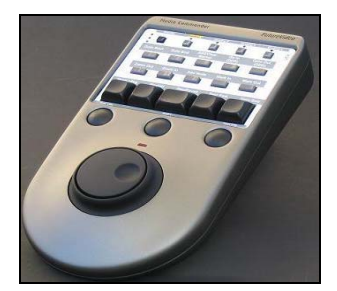
MC-20PRO Tactile Control Surface (included)

FutureVideo's MC-20PRO Multi-function Jog/Shuttle Control Surface provides precise frame-by-frame review and optimal system control for Multi-View 2.0 users. In addition, onscreen playback control buttons are provided that can be accessed with a mouse, or by keyboard short-cut keys. The controls provide for rewinding, fast forwarding to the beginning/ending of a video clip, play/pause, seeking to trim points and event marks, stepping forward/reverse frame by frame, and loop playback.